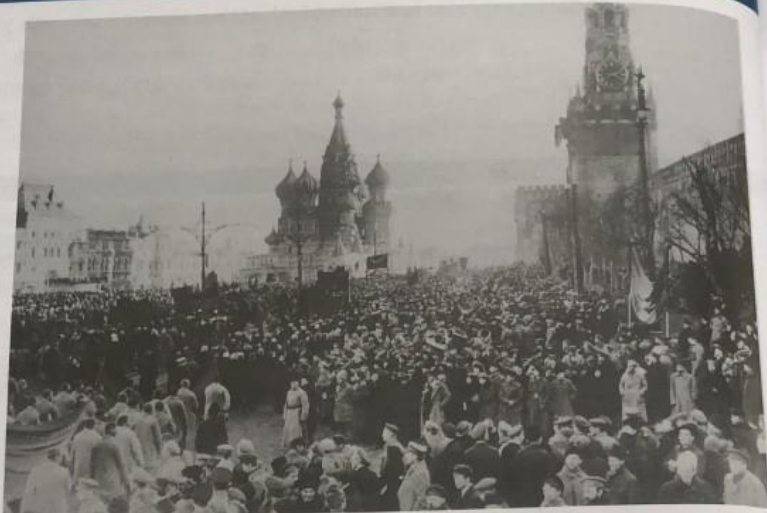
Fig. 1 Russia was considered backwards in the early twentieth century

The nineteenth and early twentieth centuries had seen huge industrial and political advances in Western Europe. The development of new forms of energy, the spread of railways and the expansion of trade together with advances in medicine and improvements in public health had helped raise living standards for an increasing proportion of the population. Alongside such change, social and political advances had occurred. Standards of literacy had increased, the old social hierarchies had broken down and an increasing number of people had gained the right to vote for a law-making assembly.