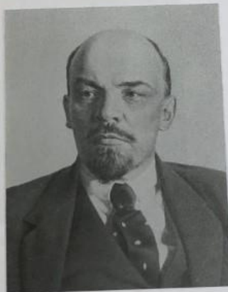
Fig. 3 Ulyanov was known as Lenin from 1901 after his exile by the River Lena in Siberia

Vladimir Ilyich Ulyanov (Lenin) (1870–1924) came from a well-to-do professional family and trained as a lawyer. He was attracted by Marxism and his activities brought him to the attention of the secret police. He was in exile in Siberia when the new Social Democrat Party was launched in 1898, but he wrote a programme for it. After his release, he went into exile in Switzerland. In 1902, he produced the pamphlet, 'What is to be done?', in which he argued that the Party needed to re-direct the workers away from trade unionism towards a revolution that would destroy the tsarist autocracy. He founded a new revolutionary newspaper Iskra (Spark) and helped develop a strong underground Party network. His harsh and uncompromising attitude led the