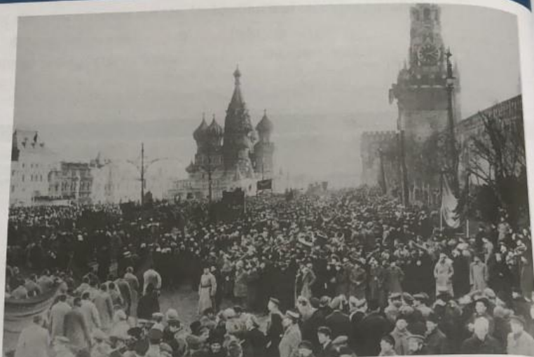
Fig. 1 Russia was considered backwards in the early twentieth century

The nineteenth and early twentieth centuries had seen huge industrial and political advances in Western Europe. The development of new forms of energy, the spread of railways and the expansion of trade together with advances in medicine and improvements in public health had helped raise living standards for an increasing proportion of the population. Alongside such change, social and political advances had occurred. Standards of literacy had increased, the old social hierarchies had broken down and an increasing number of people had gained the right to vote for a law-making assembly.