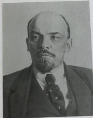
Fig. 3 Ulyanov was known as Lenin from 1901 after his exile by the River Lena in Siberia

Vladimir Ilyich Ulyanov (Lenin) (1870–1924) came from a well-to-do professional family and trained as a lawyer. He was attracted by Marxism and his activities brought him to the attention of the secret police. He was in exile in Siberia when the new Social Democrat Party was launched in 1898, but he wrote a programme for it. After his release, he went into exile in Switzerland. In 1902, he produced the pamphlet, 'What is to be done?', in which he argued that the Party needed to re-direct the workers away from trade unionism towards a revolution that would destroy the tsarist autocracy. He founded a new revolutionary newspaper Iskra (Spark) and helped develop a strong underground Party network. His harsh and uncompromising attitude led the