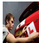
Nettleship v Weston (1971)